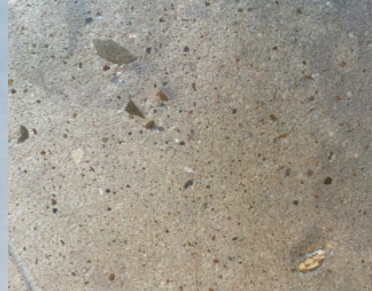
No Stain Penetration

Stain Agent: 100% Acrylic Dark Grey Concrete Stain