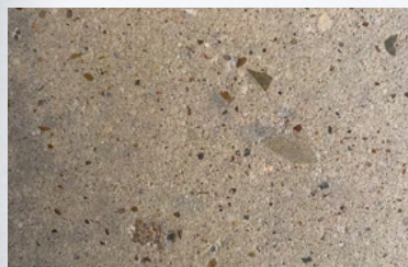
No Stain Penetration