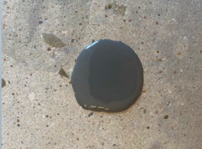
Acrylic Concrete Stain