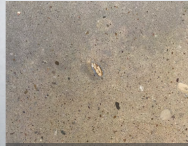
No Stain Penetration